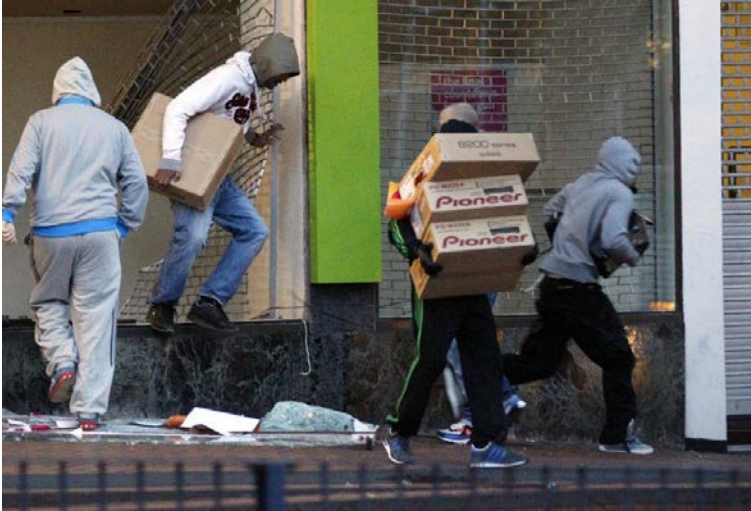
London riots 2011